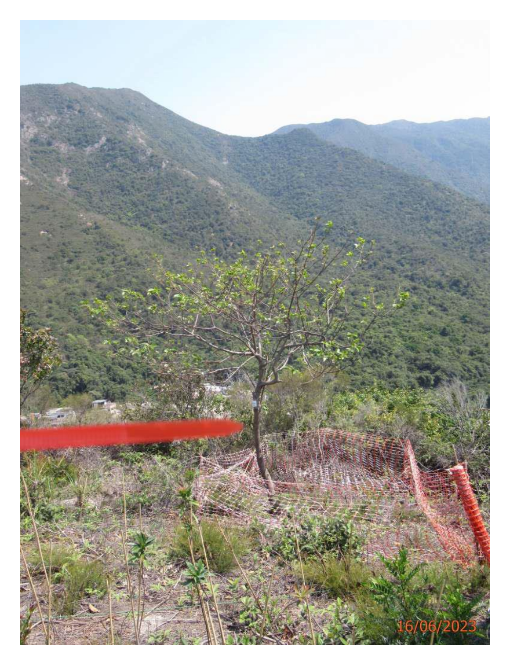
Photo 1 – Tree protection zone for preserved plant species of conservation importance