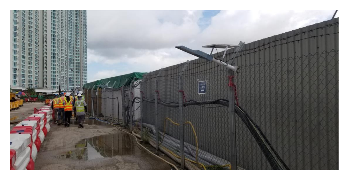
Photo 5 - Orientation of night time lighting to minimize glare impact